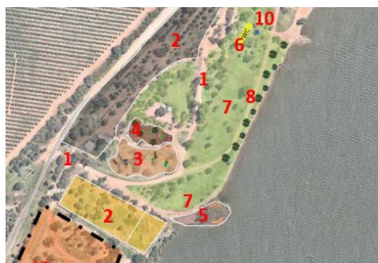
5. Viewpoint/Vantage Point with Seating